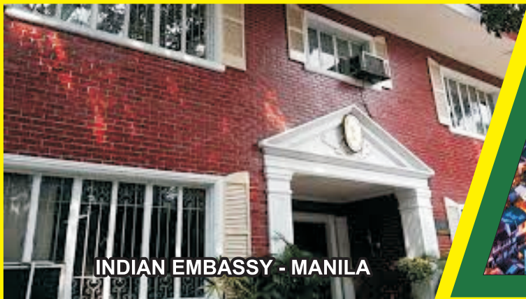
INDIAN EMBASSY - MANILA