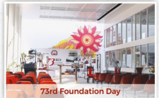
73rd Foundation Day