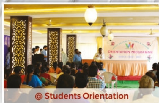
@ Students Orientation