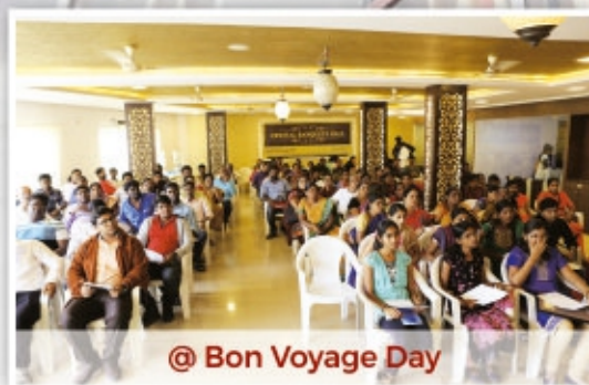
@ Bon Voyage Day