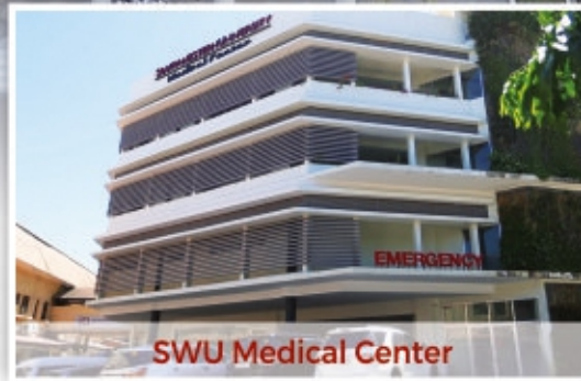
SWU Medical Center